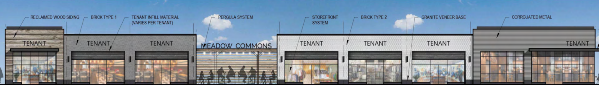
EXTERIOR ELEVATION - BUILDINGS A & B - FRONT