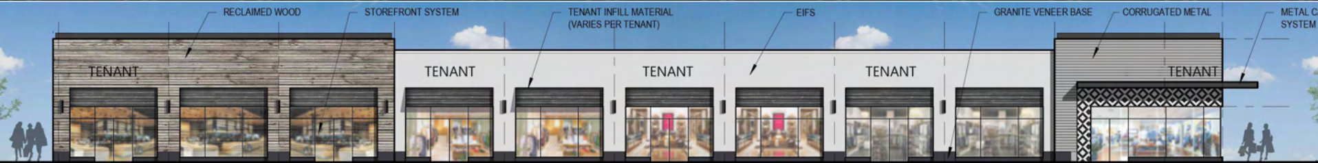
EXTERIOR ELEVATION - BUILDING C - FRONT